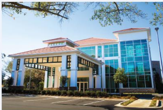
Sandestin Welcome Center 9300 Emerald Coast Pkwy W Miramar Beach, FL 32550

At this time, all Sandestin Resort guests are instructed to check into our Welcome Center, located at the resort's main entrance. As you pull into the resort, the welcome center is located on the right-hand side, before the guard gates. Currently the Grand Sandestin is not available for resort check-in.